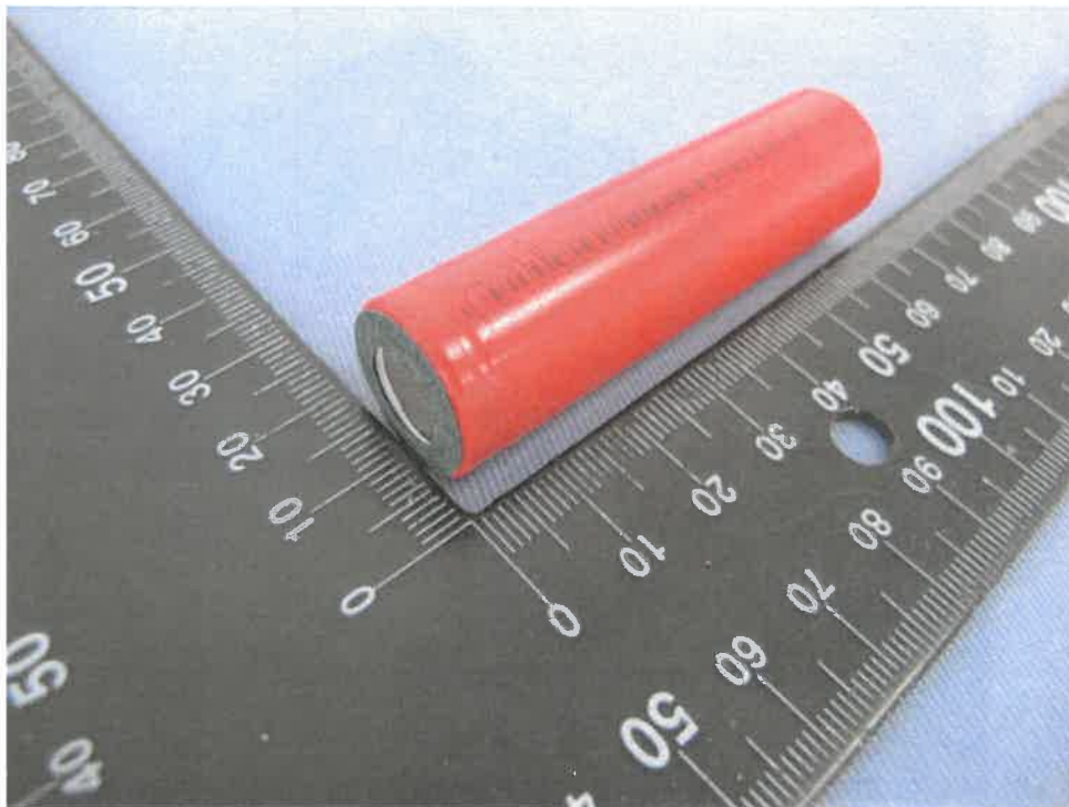
Figure 4 Overall view of cell (电芯图)